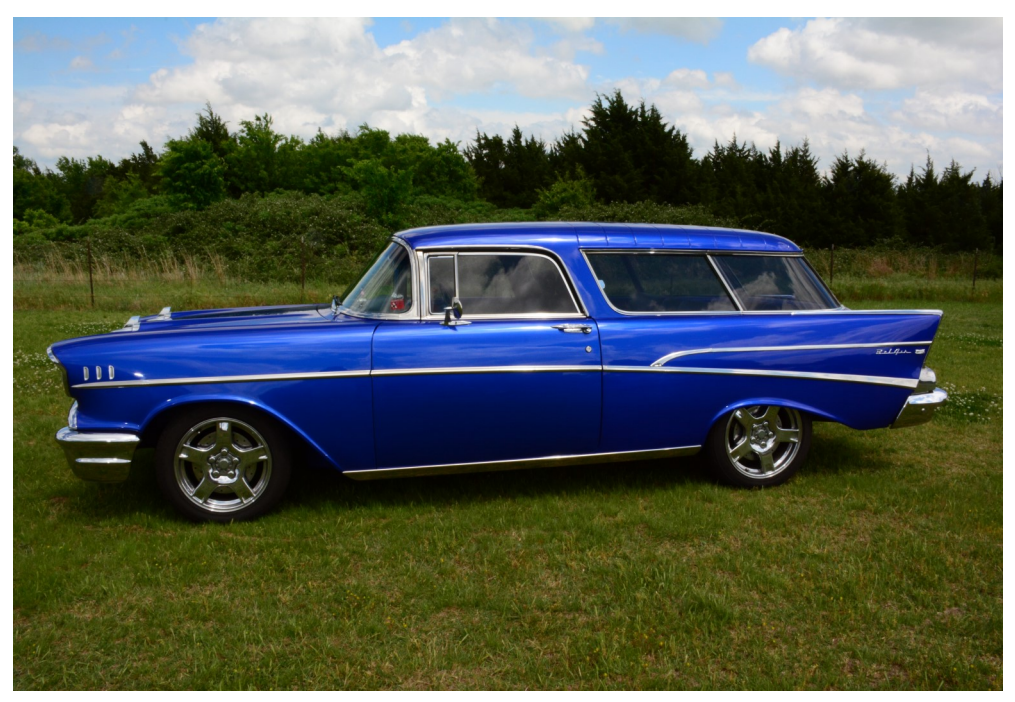
July Lady's Choice—Billy Overall's Crème Puff