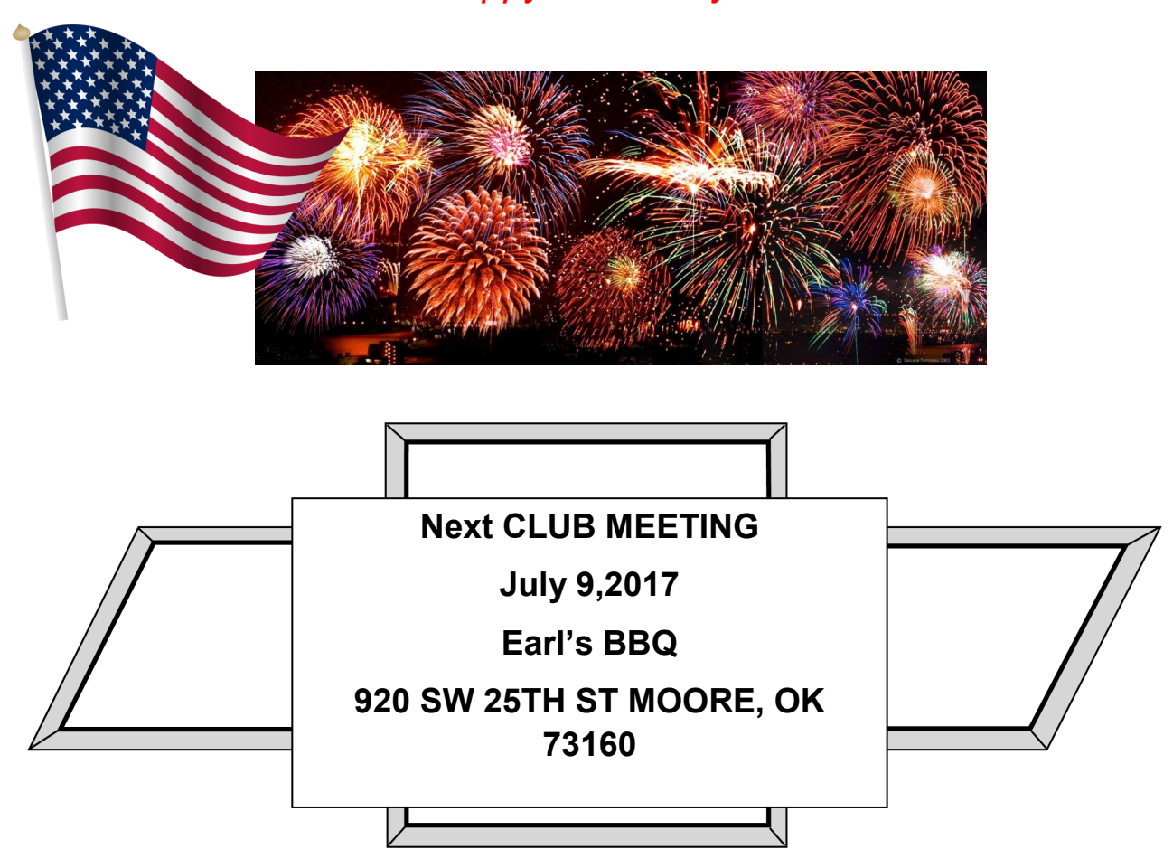
Happy 4th of July

I pledge allegiance to the flag of the United States of America, and to the republic for which it stands, one nation, under God, indivisible with liberty and justice for all.