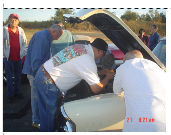
Before we even get left, we have to repair the Prez's car.

Another bonus of all the experienced mechanics' eyes checking out the Nomad was that BJ noticed that the lower control arm bushings were also worn out. So that's on the list of things to do to the Nomad before the next long trip to the Nomad Convention in Dayton, Ohio next year. One of the great things about these trips is that when something DOES go wrong (and it frequently does), there are lots of experienced Classic owners on hand to share their knowledge, tools and talent! Thanks everyone!!!