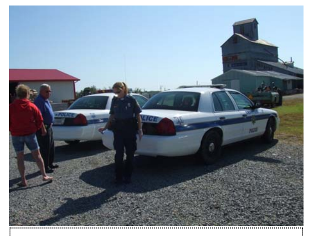
Choatau's police are called.