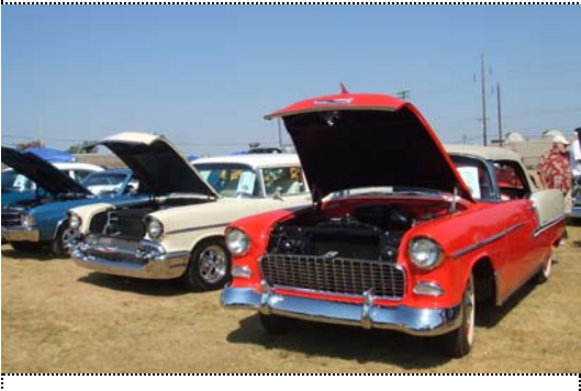
Hensley's '55 & Overall's '57