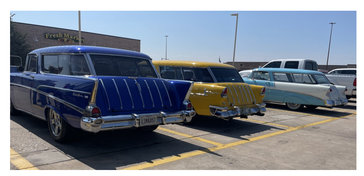
"The end" of a wonderful meal and cruise with wonderful cars and friends. Let us do it again another day!