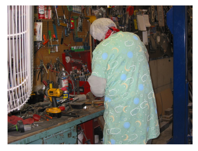
Who is this in his wife's gown?

Editor's note: I have no clue who this is.