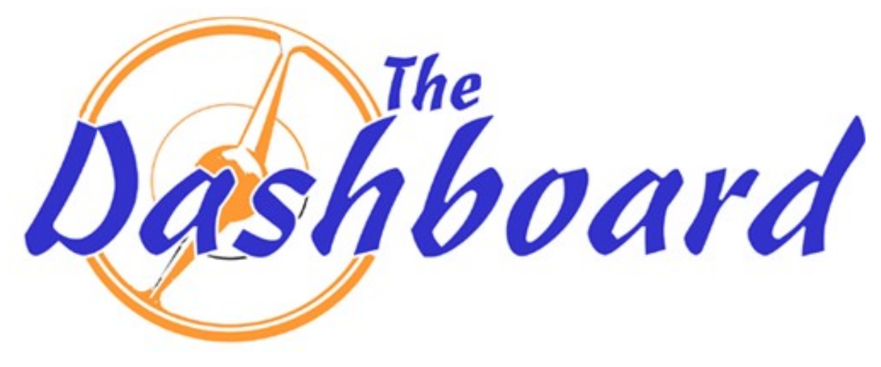
A Publication of Central Oklahoma Classic Chevy Club May 2024

In view of the recent storms, I'll make no attempt at humor or trivia. These storms were packed with violent tornadoes, high speed winds and heavy rains resulting in several deaths and massive destruction. The forecast for this week also involves possible severe storms.